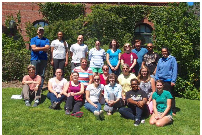
Snapshots from the August 2014 Nature and Me: Explorations in Ecology workshop at the Arnold Arboretum